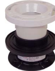
Note: Closet Flange Not Included